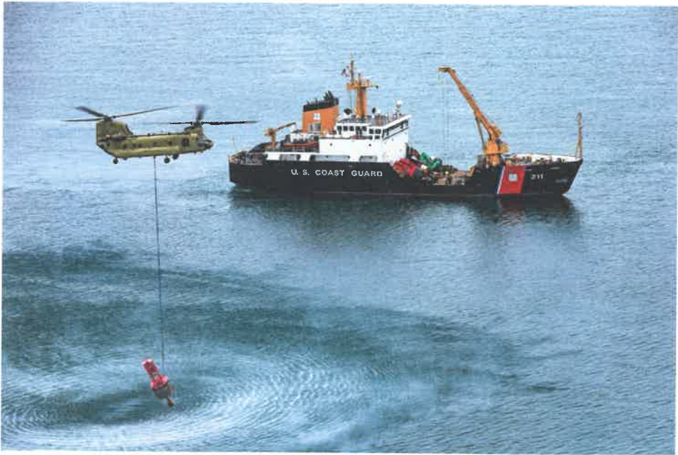
A CH-47F Chinook helicopter from the 2/104th Aviation Regiment, Connecticut Army National Guard, hoists a recovered buoy into the water adjacent to U.S. Coast Guard Cutter Oak (WLB 211) off the coast of Nantucket, Massachusetts, June 1, 2022.