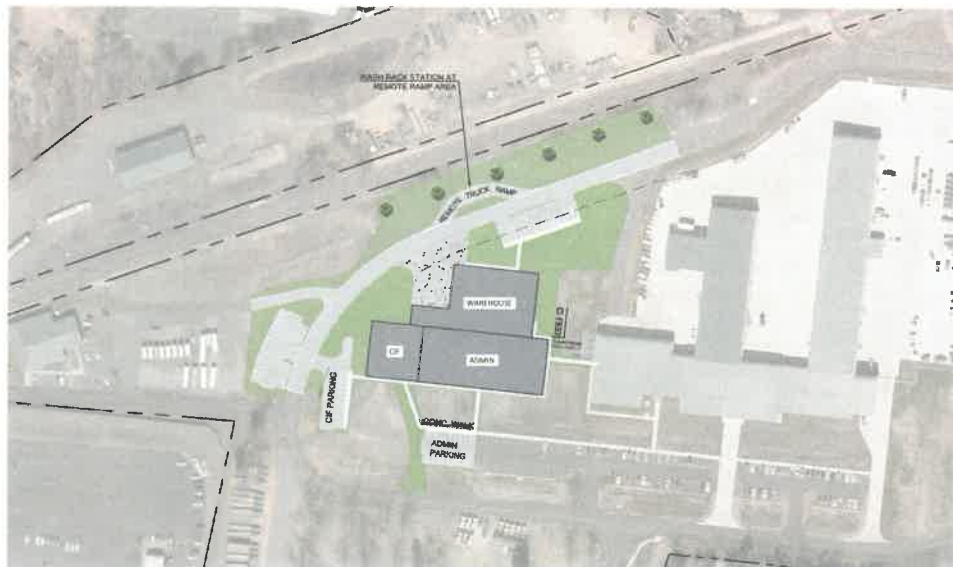
PROPOSED USPFO WAREHOUSE PHASED CONCEPT