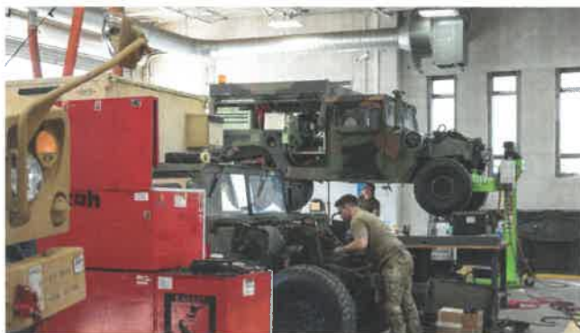
UTES MAINTENANCE BAY

UTES serves as the primary maintenance facility for CTARNG construction, bridging and Military Police equipment used in response to state emergencies. Originally constructed in 1941 and 1979 the facilities no longer meet mission requirements due to the increasing equipment sizes and newly fielded equipment. Many vehicles supported by the facility do not fully fit into the maintenance bays. Additionally current locker rooms and latrines are not to code and do not support the number of mechanics assigned to the facility.