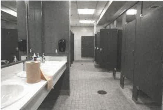
BARRACKS LATRINE UPGRADE: Complete remodel for barracks latrines.

This multi-phased project will modernize the Transient Training Barracks on Camp Nett at Niantic. These projects will provide Connecticut National Guard Soldiers with modern facilities to help increase Soldier readiness and improve support for state emergency response.