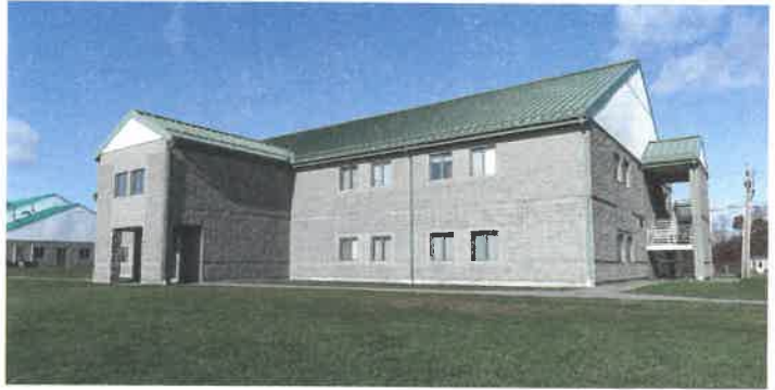
800 Series Barracks Doors and Windows replacement project.