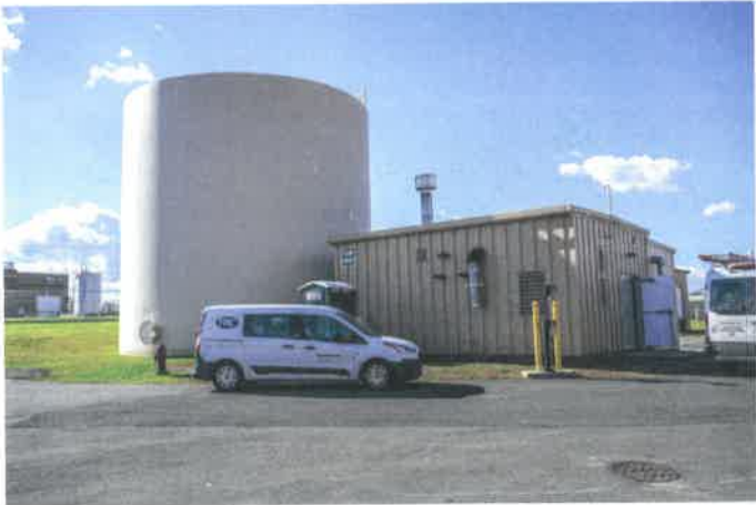
ARMY AVIATION SUPPORT FACILITY FIRE SUPPRESSION FACILITY. Construction completed in 2022.

This project upgrades the safety, efficiency and aviation operations of our primary rotary wing facility.