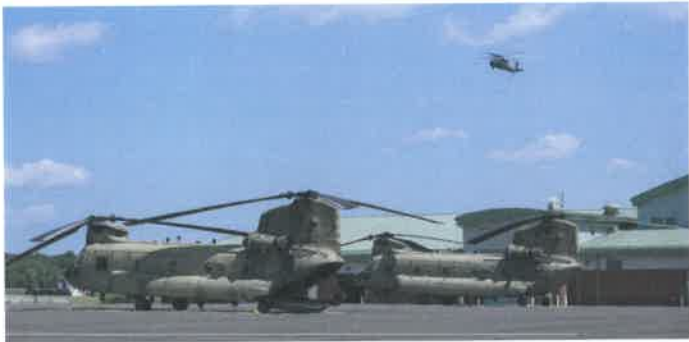
CH-47 AND UH-60 AIRCRAFT AT THE AASF, WINDSOR LOCKS, CT

Total Project Cost is $17M. All projects are 100% Federally funded.