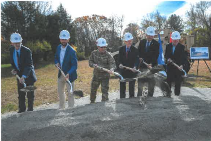
PUTNAM READINESS CENTER GROUNDBREAKING CERMONY OCTOBER 2022

The Putnam Readiness Center is part of the Future Years Defense Program for FY 2022 at a cost of $19.5 million Federal dollars and $6.5 million State dollars. The demolition of surplus buildings is complete. Environmental review is complete, and the design completed by Ames and Whitaker Architects. The construction contract is complete and was awarded to the Morganti group in September 2022.