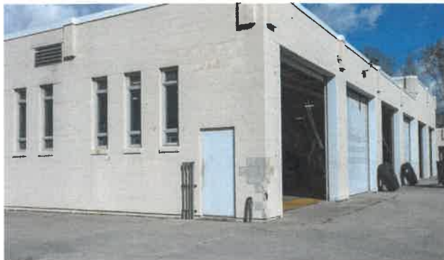
UNIT TRAINING EQUIPMENT SITE, EAST LYME