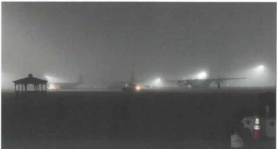
Connecticut Air National Guard C-130H aircraft at Bradley Air National Guard Base conducting air lift operations.