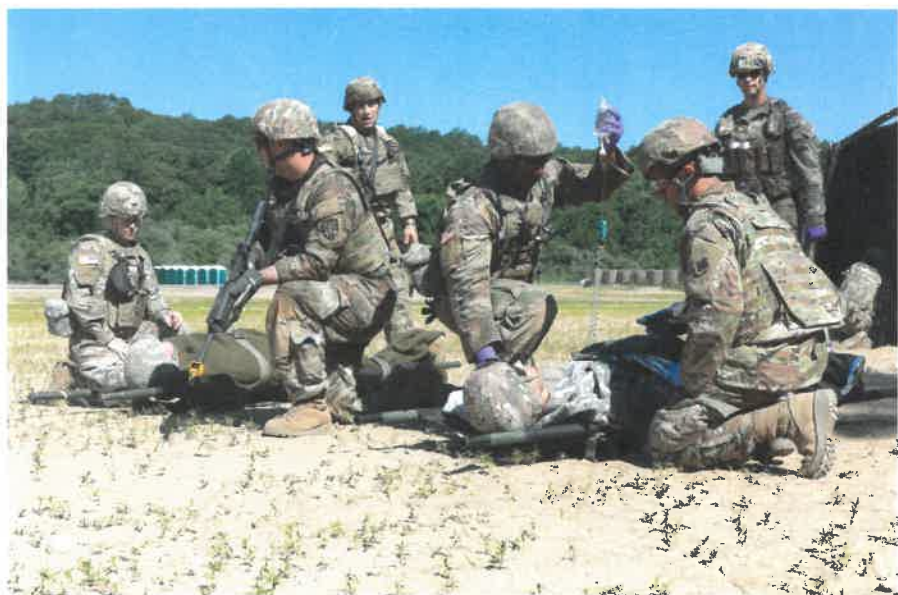
Soldiers take part in 68W (Army Medic) training at Stones Ranch Military Reservation.